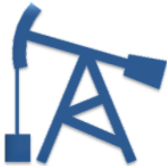
RESEARCH AND MINING